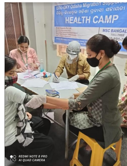
Health care services at Shahi's Migration Support Center

Shahi has also been partnering with Good Business Lab (GBL) to conduct research on the role major employers of women, such as garment factories, can play in improving access to sexual and reproductive health services. It is developing a peer-to-peer support curriculum for these services, which will be implemented in small groups of 10 workers meeting weekly over four months. GBL will evaluate this group against a control group in a randomized controlled trial and then evaluate the change in knowledge, behavior, and attitude of workers toward sexual and reproductive health. It will also evaluate the effect of sensitizing workers regarding SRH in small group settings. This study, which will cover 4,500 workers, will be rolled out in the third quarter of 2021, with concluding surveys completed by June 2023.