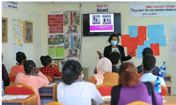
Train the Trainer program on women’s health and rights

Since its commitment in 2020, EHPEA has reached 6,500 workers, 75 percent of whom are women, with information on preventing workplace sexual harassment and gender-based violence as well as information on family planning, nutrition, hygiene, and sanitation; three-quarters of the workers reached were women. In partnership with the Family Guidance Association of Ethiopia, EHPEA built capacity and skills for 11 farm nurses on 10 farms to provide voluntary contraception, including long-acting methods, and cervical cancer screenings for women workers. More than 700 women have had a screening. EHPEA also conducted three outreach and advocacy workshops with local government stakeholders