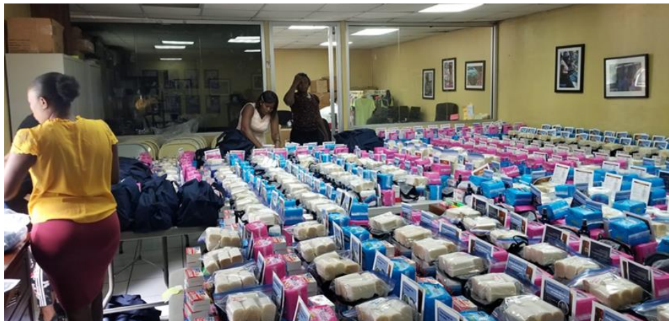
Preparing care packages in response to the earthquake.

Since last year, Share Hope has reached 839 workers, 89 of them in 2020. Its target for the P.A.C.E. program has been 750 women workers a year, and the expectation is that it will achieve that goal in 2021, in addition to the three factories that are implementing P.A.C.E. internally with the support of the Share Hope team. Share Hope made a strategic shift to focus on P.A.C.E. training for unemployed women workers as there was interest and demand by this cohort, and on-site training was difficult given the production pressures and safety challenges in factories under COVID-19. Each worker who completed the program was given a certificate, and Share Hope then put them in contact with hiring managers at factories to be considered for available jobs.