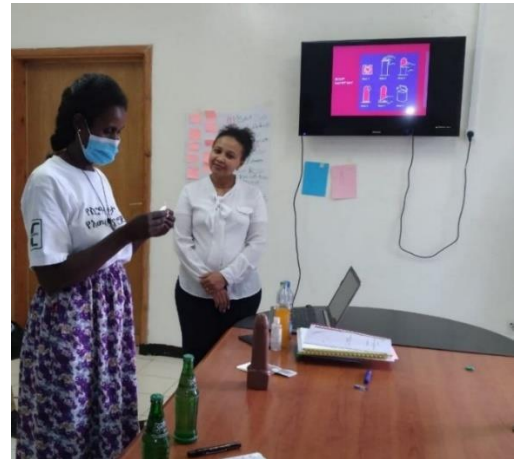
Train the Trainer program on women's health and rights

Finally, after the COVID-19 pandemic hit the Ethiopian horticulture market, EHPEA established a COVID-19 Taskforce, which is tasked with designing workplace COVID-19 protocol and supporting farms with its implementation to prevent and control the spread of the virus. So far, the Taskforce has leveraged virtual communications tools for each focal point at 62 farms with relevant information and is facilitating information-sharing among farms on preventative activities like social distancing, temperature testing, and hand washing; it plans to continue using virtual platforms like Zoom and WhatsApp to communicate going forward. The Taskforce also put forward recommendations to the government on mitigation measures to support the horticulture industry, which resulted in financial and technical support that has, in turn, supported the women workers in the industry and helped stabilize the working environment. EPHEA is funding all its activities through cost-sharing fees from member commercial farms and financial support from partner organizations.