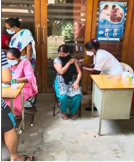
COVID-19 vaccination for Shahi workers.

All the while, Shahi has focused primarily on worker health and support for its mostly female workforce with COVID-19 mitigation, prevention, and vaccination. It reports that close to 90% of its workforce has been vaccinated on-site through partnerships with private hospitals, government agencies, and public hospitals. During the second wave in India, COVID-19 care centers were established in factories and company offices for employees and dependents with beds and oxygen cylinders. Its in-house doctors are on call for medical guidance, and outside specialists are available for further medical advice. It is also supporting migrant workers across industries (including garments, retail, and construction) through its Migration Support Center with psychological, social, and informational services to help them settle in new urban environments. In partnership with GBL, Shahi has created its own digital worker communications platform, called Inache, in 2019 as a technology solution allowing workers to SMS or voice message the factory management with their suggestions, feedback, and questions. During the pandemic, this has been rolled out in 35 factories and is launching in 5 more factories in 2021.